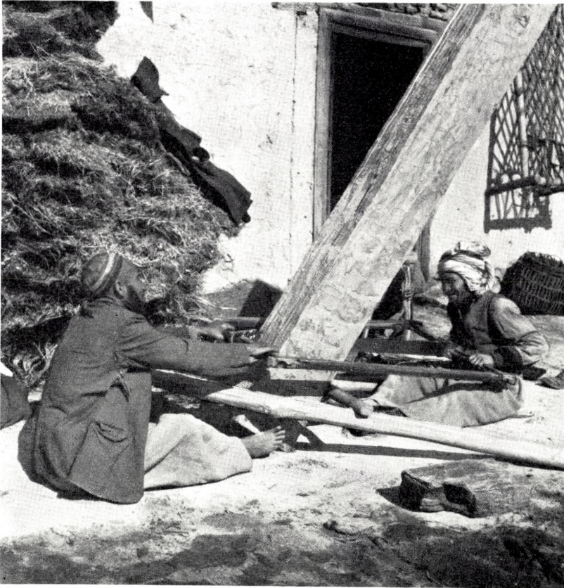
Fig. 13. Hazāra labourers in a street in Kābul sawing up a plank into boards (Spring 1954 by K. F.).

used similarly in most of Afghanistan just before sowing and usually also immediately after it, to get the seed into the ground. The fields are often sloping, and are therefore traversed with tiny furrows to lead the water over them without erosion. Often these fields are slightly terraced, but elaborate terracing with nearly horizontal surfaces is rarely found.