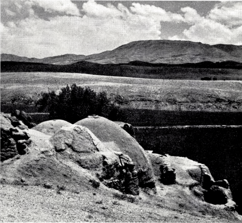
Fig. 2. Village of domed houses (Bād Āsiā, Besūd, 2800 m) at the edge of the farmland. These houses are used for habitation the whole year. (August 1954 by K. F.).

sect (the Ismaʿīliya Hazāras are not really admitted as Hazāra by the Hazāras of the Shīʿa).