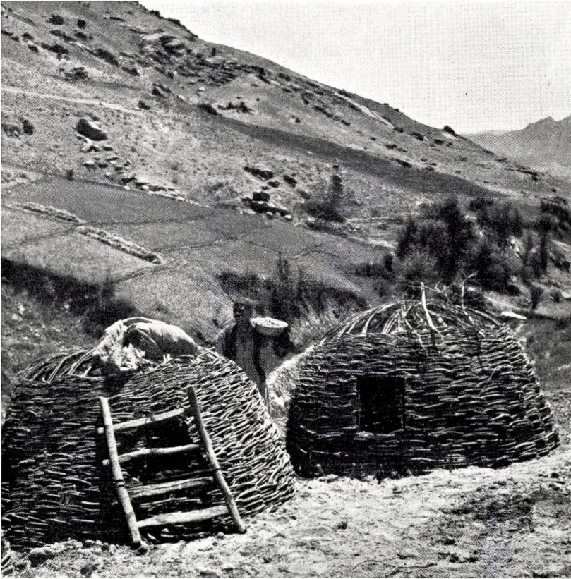
Fig. 9. 'Āghil', movable "wattled" branch "huts", with entrance in the middle of the side. These are used as shelters for sheep and goats in the midday sun and at night; then they are covered with some kind of cloth. The entrance to the 'āghil' on the left is closed by a ladder. (Bāgh, Shahrīstān, July 1954).

towards the South, where it becomes rain. Now and then, the monsoon from the South-East will bring slight rain to the Eastern elevated parts in late summer, otherwise the summer is dry with a cloudless sky.