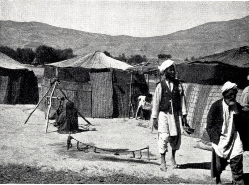
Fig. 7. Firōzkōhī 'chapiers' at 'Gandao' near Daūlatyār. The roof has got an extra cover of mats on top of the goathair "cloth". The vertical mats of the middle 'chapar' are painted with mineral colours dissolved in milk. Note the tripod churn of the same type used among the Hazāras. (July 1953 by K. F.).

get share payment. As the nomads often are "capitalists", they lend the Hazāras money, and take land as security as long as the loan is not paid back (the so-called ejāra system); during that time the Hazāra is the tenant of the nomad, and as it often happens that he is unable to pay back his loan, he will remain a tenant. In their trade the nomads usually give the Hazāra credit till the following summer, and then get payment in kind, but the poorer Hazāras are often unable to pay and then the debts are increased considerably, and the payment postponed for another year, and so it runs year after year with the result that the Hazāra loses his land and ends up as tenant for the nomad. This is what may and does happen in large parts of Hazārajāt in these years.