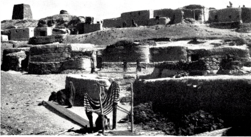
Fig. 1. The village Garmāb, West Hazārajāt, with stacks of cow-dung cakes ('chalma') on the flat roofs of the mud houses. In the front a simple hand-loom for making rugs ('gelam'). This village is situated at such an altitude, that the villagers remain in their houses during the summer.

features met among some of the tribes (but found to a far less degree than among the Hazāra of the Hazārajāt), and by many Central Asian cultural elements, such the yurt, the chaparī (vide p. 15 ff.), the churn, etc., found among the northern tribes, i.e. the Fīrōzkōhī, the Jamshēdī, and the Hazāra-i-Qal'a-i-Nau. There are also other cultural traditions, which for example are shown by the existence, only among the Taimanī, of a special type of the black tent (vide Fig. 6). It is noteworthy that this black tent is not closely connected with the Afghan black tent types, 1 and also that the yurt does not exist among the Taimanī. It is therefore possible culturally to distinguish between two main groups: The Northern Aīmāqs (i.e. the Fīrōzkōhī, the Jamshēdī, and the Hazāra-i-Qal'a-i-Nau), and the Southern Aīmāqs (i.e. the Taimanī). In reality there is also a third group, consisting of the Tīmūrī and many of the so-called Ēlāts. These tribes are mostly half-nomadic, or even totally nomadic, and culturally are not easily distinguished from the Afghans (mainly of the Durānnī tribes), thus they use the Durānnī type of the black tent. In other