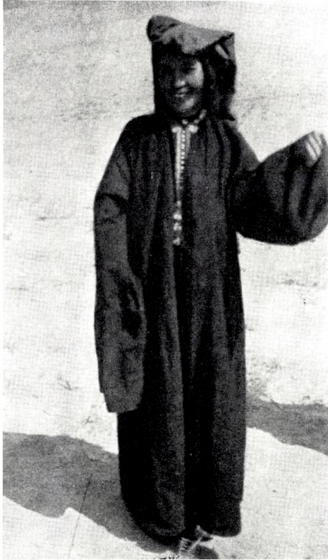
Fig. 10. Hazāra woman of Shahrīstān clad in the, now very seldom seen, old Hazāra dress: Remarkable are the long sleeves and the head dress, a piece of cloth folded up, which together with the physical features, give her a very “Mongolian” appearance. (July 1954 by K. F.).

made mat of felt for covering the floor when the family go to sleep. It is astonishing to find clean and tidy houses—with piles of cow-dung just outside the door.