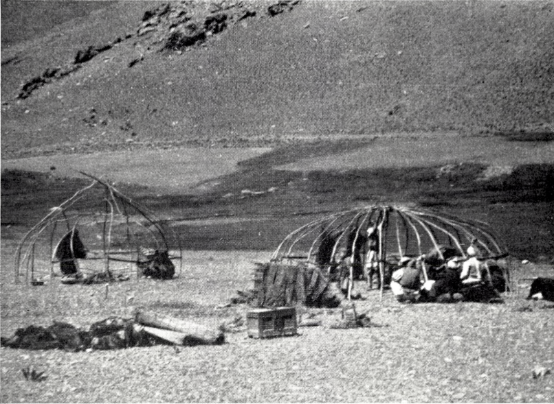
Fig. 3. 'Chapiers' of the Northern Hazāra during pitching by women and one man in a side valley of the Ghōrband ('Dāy Kalo' tribe, 'Urdogali', 3100 m). On the left the curved sticks ('chapar-chub') have just been stuck into the ground by the women, and on the right the man(!) assisted by the women tie the curved sticks to the central pole ('acha'). (July 1953 by K. F.).

wa Fōlād and in Gēzāo (Gēzāb) to the North West of the Helmand. In the West the Hazāras border on the Āimāq area, but as good maps are lacking, this will roughly say, the Ghōr, Chaghcharān and Sangchārak. This border I can only define exactly at the (Kābul-) Panjāo (Panjāb)-Herāt road, where it runs a little to the East of Daulat Yār just west of the Hazāra village Garmew (Garmāb).