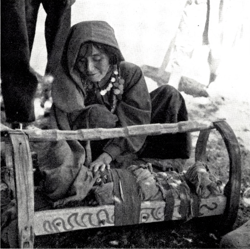
Fig. 11. Hazāra woman (note her modern narrow cuff) with her cradle ('gawara' = P. gahwāre), in which the child is firmly tied up. (Bāgh, Shahrīstān. July 1954).

in the mountains, but also round the villages in the early summer and autumn. This suggests that the Northern Hazāras [formerly were used to a more unsettled life, and it was then no wonder that they were all well acquainted with the construction of a yurt (H. and ASP. ' khergā '). We were told that some 50—60 years ago the yurt was in common use among them, besides the chapari . This very much resembles the situation among the Northern Āimāq and among some of the Uzbeks of Qataghan, where nowadays the yurt and the chapar are found side by side.