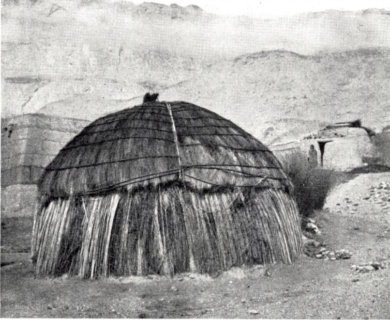
Fig. 5. 'Chapar' completely covered with straw from the Hazāra between Dōshī and Pul-i-Khomri. The frame consists of curved sticks and there is no central pole. This type is also found with mats and felt cover. (Phot. by Peter Rasmussen, November 1953).

place. It is most likely that this process took place continuously from the first arrival of the Hazāras in Afghanistan; but it is very hard to get any further information about this, because oral tradition has very vague ideas of time, even when reckoned in generations. The Saiyeds , although culturally Hazāras, hold a special position; they are supposed to be the descendants of the Prophet Mohammad, and are therefore very much respected by the lay people, who give a tithe of their harvest to them every year ( \frac{1}{10} or even \frac{1}{5} in some places). This position they certainly want to retain by keeping themselves pure, so they do not intermarry with ordinary people. Concerning the other groups, it is tradition alone that tells that the subtribe so and so is of another origin than the rest.—You will find Afghān Hazāras all over Hazārajāt, and in some cases you can see, just as in the case of the Saiyeds , that they are somewhat less mongoloid than the rest.