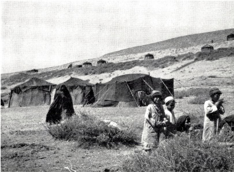
Fig. 6. Tajimanī summer camp in Shaharak with the special Tajimanī black tent and 'chapars' of the Ajmāq type, with the vertical lower and the conical upper part. Mats and woven goat-hair "cloth" are used as covers of both types of tents. (July 1953 by K. F.).

time very few dared to go to Hazārajāt; the nomads kept to the Pashtūn area, and very few trade-caravans passed through the central parts, they preferred the route by the Ūnaġ, 'Hajġak', and Īrāq passes, to Bāmīān, and the more northern routes through the Sheikh 'Alī area in the Ghōrband valley held open by force and subsidies.