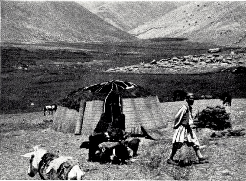
Fig. 4. The 'chapar' (Fig. 3 on the right) now pitched with straw mats ('chēgh') round it and felt ('namad') on top, leaving a smoke-hole open above the door. In the background uncultivated meadow. (July 1953 by K. F.).

supported and strengthened by analogy with the Pashtū -zai (= son of ) (Persianised -jai , as e.g. in Ghiljai ). 1 In spite of this argument and the others referred to above, it must be added that the actual meaning of Dāy has yet to be explained. It is not at all clear today, whether Dāy is Mongolian after all, or simply just means son or descendent, which would give the best explanation.